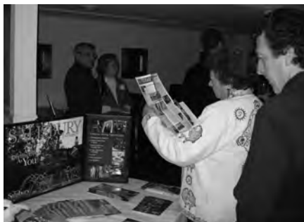
Chamber members check out Salisbury University's Member Spotlight table.